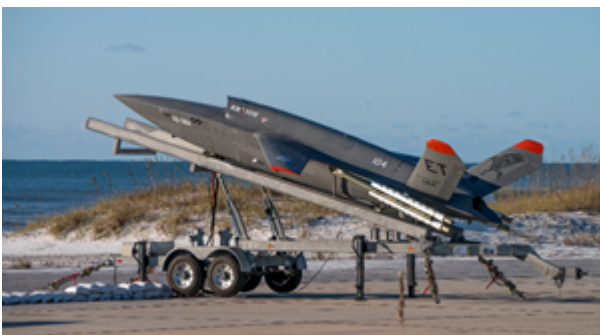
Kratos XQ-58A Valkyrie Ready for Flight