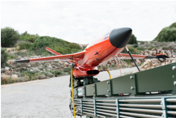
Kratos MQM-178 Firejet on Launcher