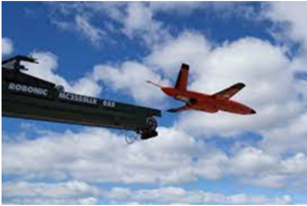
Kratos MQM-178 Firejet Takes Off