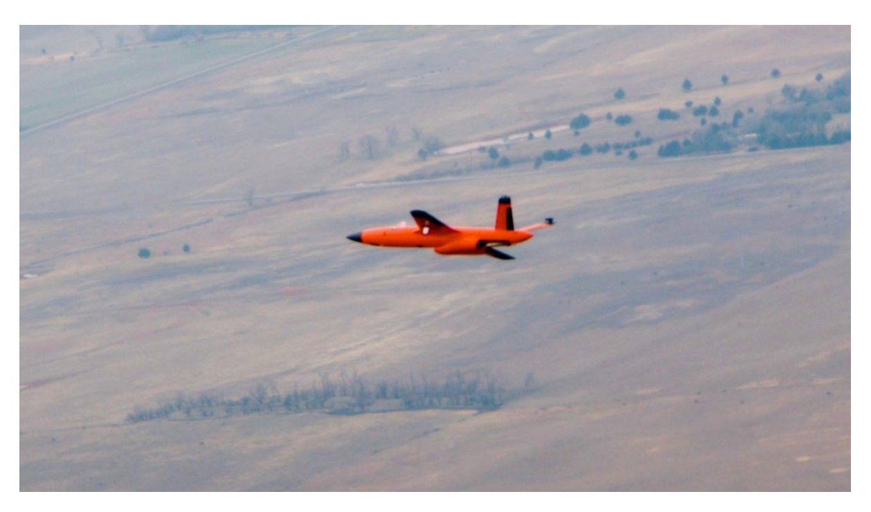
Hivemind-Directed Autonomous Maneuvering Underway

A photo accompanying this announcement is available at <a href="https://www.globenewswire.com/NewsRoom/AttachmentNg/2f2f2042-c0a5-4d03-a150-050c454a3e2b">https://www.globenewswire.com/NewsRoom/AttachmentNg/2f2f2042-c0a5-4d03-a150-050c454a3e2b</a>