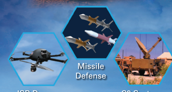
ISR Drones C2 Systems