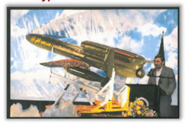
Directed Energy Weapons