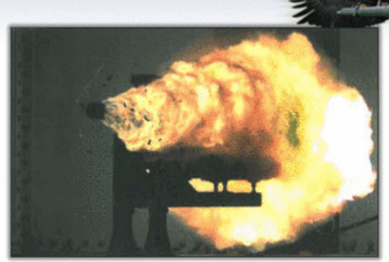
Electromagnetic Rail Gun