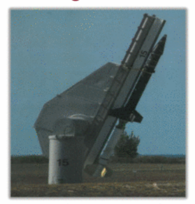
Aegis Readiness Assessment Vehicle (ARAV)

NASDAQ: KTOS 16 DEFENSE & SECURITY SOLUTIONS