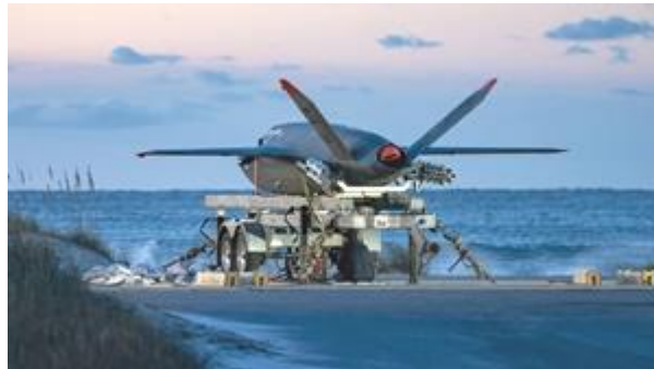
Kratos XQ-58A Valkyrie System on Launch Trailer