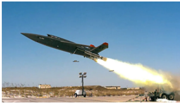
Valkyrie Demonstrating Runway Flexible Launch