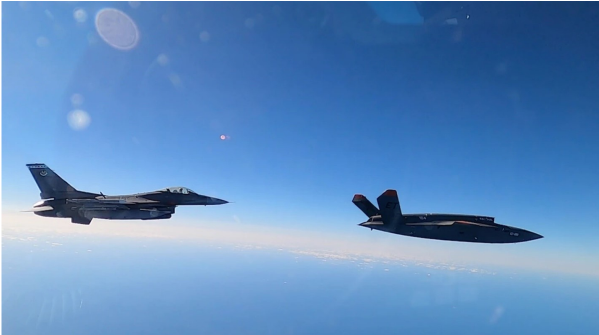
XQ-58A and F-16 Together in Flight is available at https://www.globenewswire.com/NewsRoom/AttachmentNg/a5df42a1-da42-4151-b48c-d59e3634ad2a