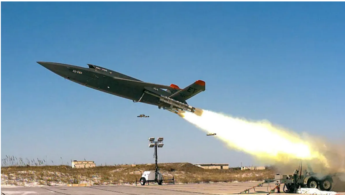
Valkyrie Demonstrating Runway Flexible Launch is available at https://www.globenewswire.com/NewsRoom/AttachmentNg/4565e923-0148-4f79-8d9c-3004c4a5237d