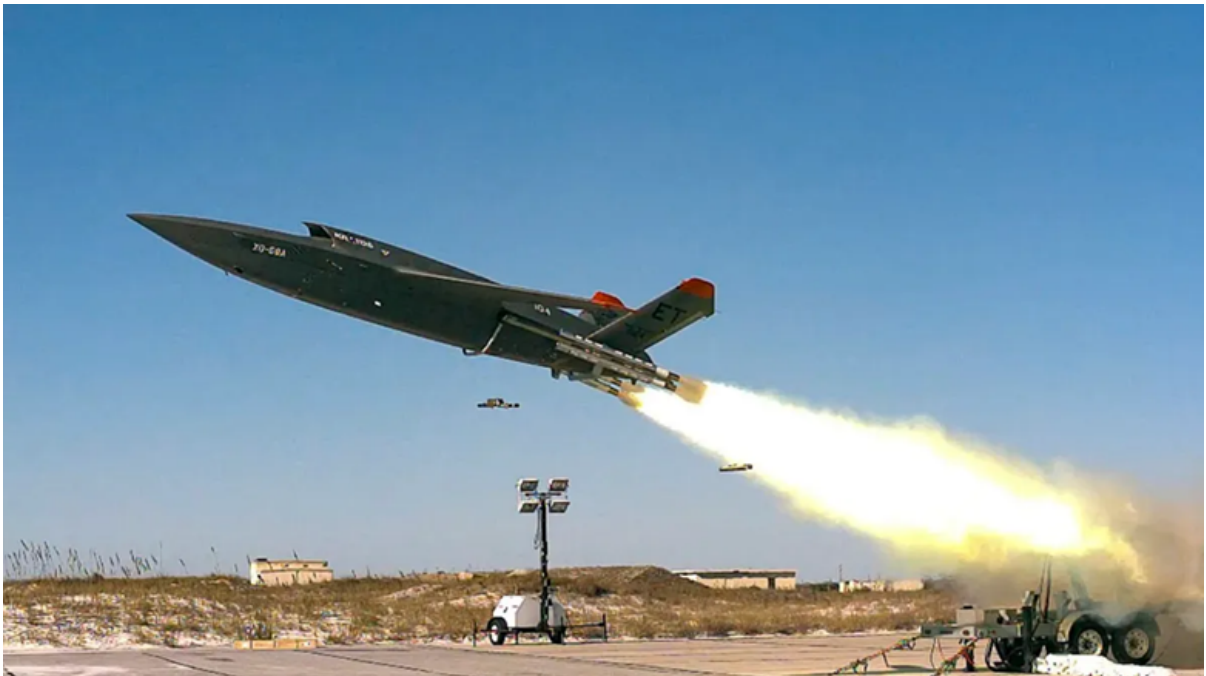
Valkyrie Demonstrating Runway Flexible Launch is available at https://www.globenewswire.com/NewsRoom/AttachmentNg/4565e923-0148-4f79-8d9c-3004c4a5237d