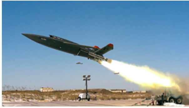
Valkyrie Demonstrating Runway Flexible Launch