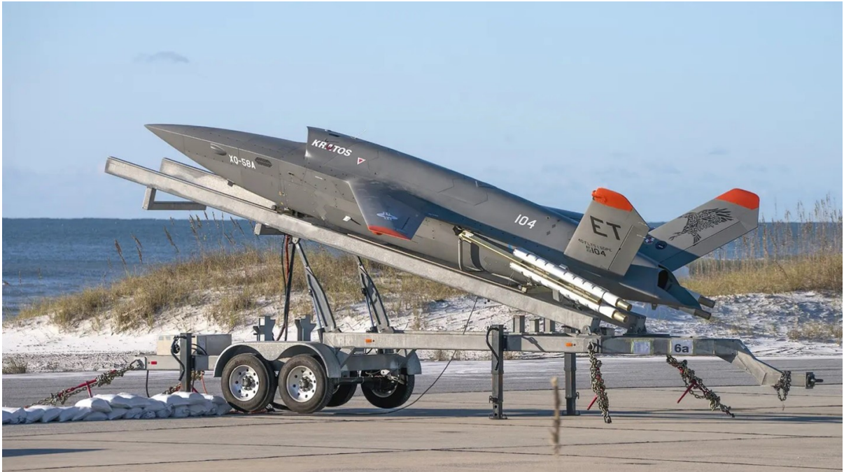
Kratos Valkyrie Aircraft on Launcher at Launch Attitude is available at https://www.globenewswire.com/NewsRoom/AttachmentNg/afcee532-9936-4f6c-b9e5-824cd88fc905