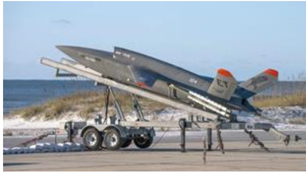
Kratos Valkyrie Aircraft on Launcher at Launch Attitude