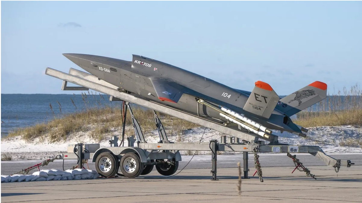
Kratos Valkyrie Aircraft on Launcher at Launch Attitude is available at https://www.globenewswire.com/NewsRoom/AttachmentNg/afcee532-9936-4f6c-b9e5-824cd88fc905