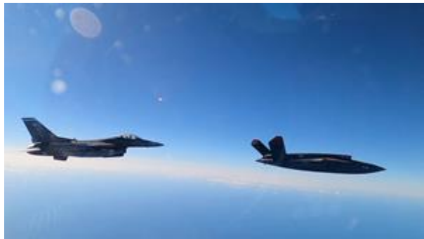
XQ-58A and F-16 Together in Flight