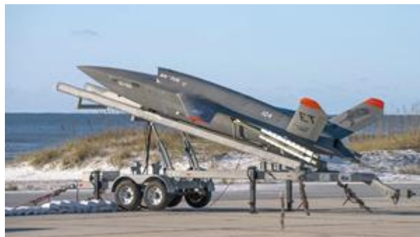
Kratos Valkyrie Aircraft on Launcher at Launch Attitude