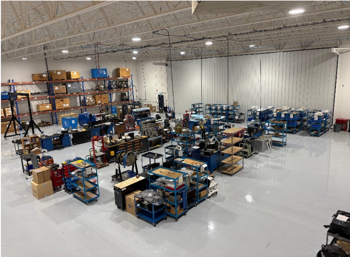
Kratos MRO Canada's New Facility

A photo accompanying this announcement is available at https://www.globenewswire.com/NewsRoom/AttachmentNg/30d7c652-f958-4302-a1b9-d782e597794d