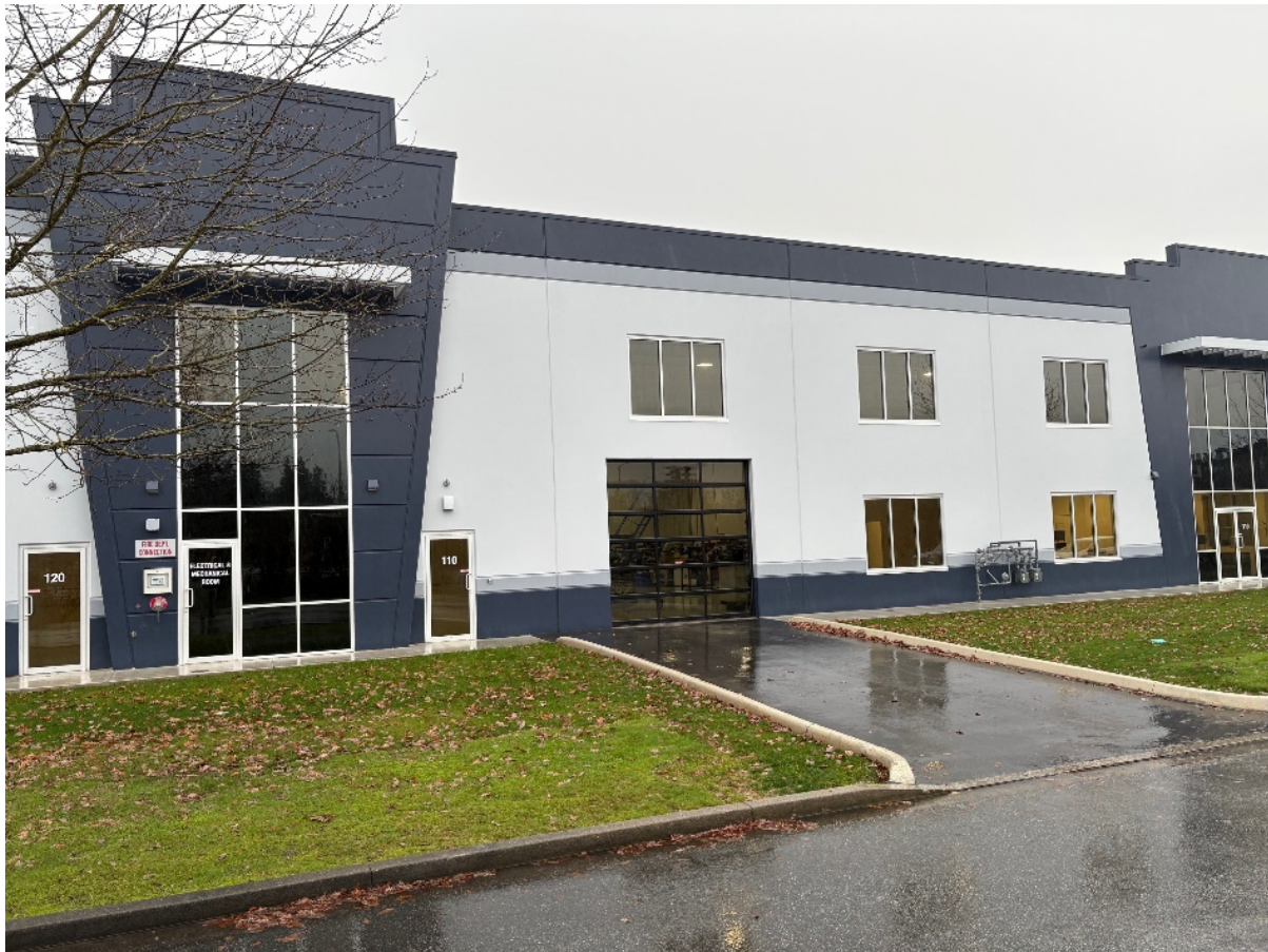
Kratos MRO Canada

SAN DIEGO, Dec. 05, 2025 (GLOBE NEWSWIRE) -- Kratos Defense & Security Solutions, Inc. (NASDAQ: KTOS), a leader in defense, national security and global markets, today announced the opening of its new state-of-the-art 10,000 square foot facility for PT6A and PT6T engine overhaul in Vancouver, British Columbia—a significant milestone in the company's continued growth and innovative support of the PT6A and PT6T engine market. This modern space has been designed to enhance operational efficiency, foster collaboration, and provide the infrastructure needed to meet the evolving demands of the industry. The expansion underscores Kratos' commitment to delivering cutting -edge solutions and ensuring that its teams have the resources required to drive excellence across all areas of operation.